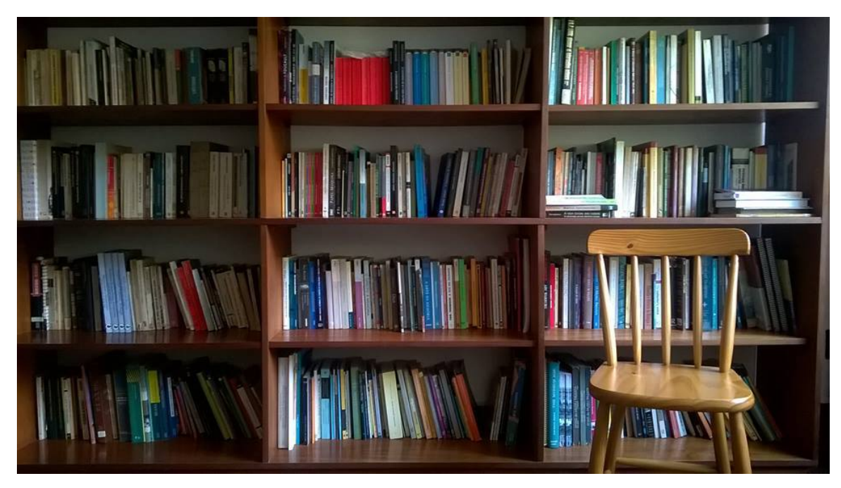
Figure 1